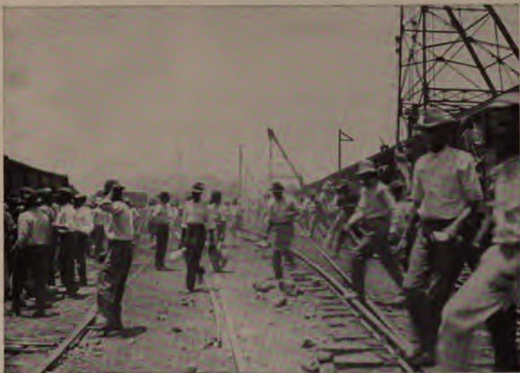
"Toward noon the labor-train screamed in"